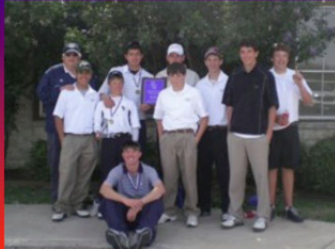
SV Takes 1st Place in San Marcos