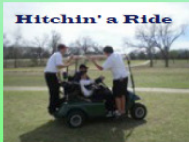
Hitchin' a Ride