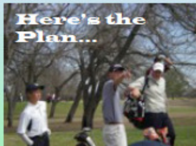
Here's the Plan...