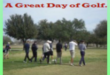
A Great Day of Golf.